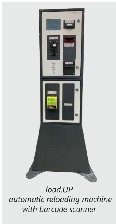
load.UP automatic reloading machine with barcode scanner

Alternative authentication via barcode or magnetic card