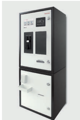
load.UP with extension module for issuing cards and coins

Measurements (H x W x D): 560 x 370 x 305 mm Weight approx. 18 kg