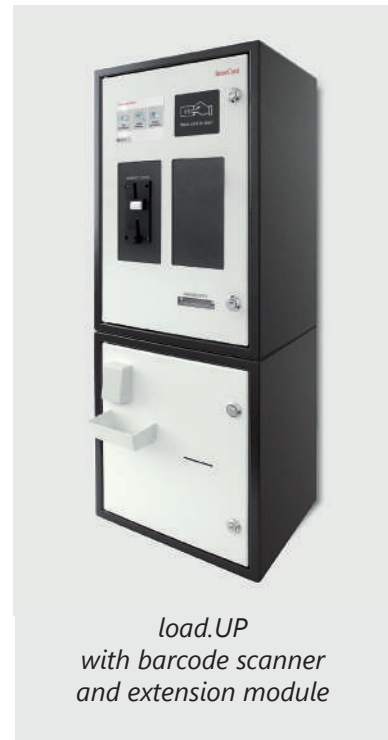
load.UP with barcode scanner and extension module