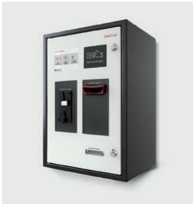
load.UP basic unit

Measurements (H x W x D): 560 x 370 x 305 mm Weight approx. 18 kg